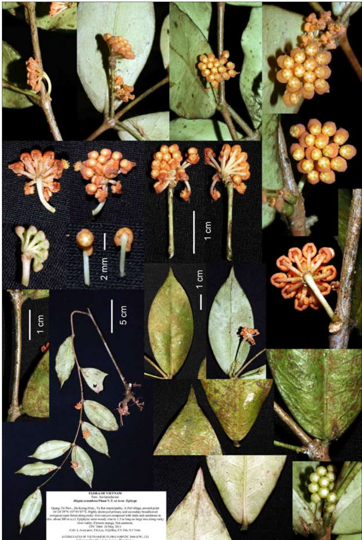
Fig. 2. Hiepia corymbosa . Digital epitype (d-EXSICCATES OF VIETNAMESE FLORA 0188/CPC 3066).